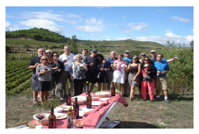
Doctors-on-Tour - Spain