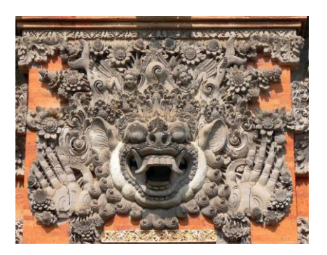
Day 6 - April 30 (Thu) - Ubud - Royal Family & Udayana University (B,L)