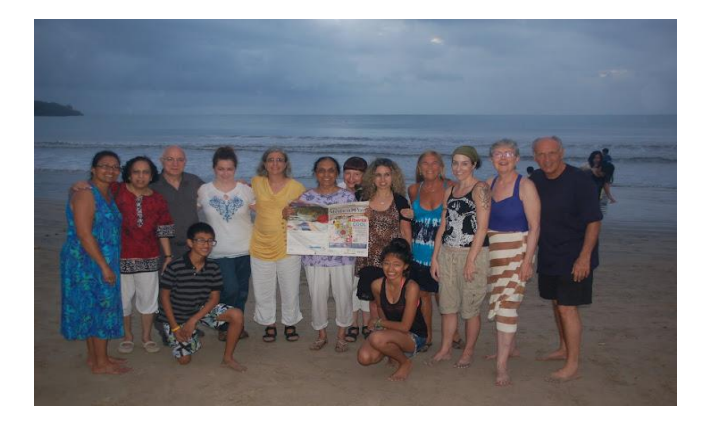
Doctors-on-Tour - Bali