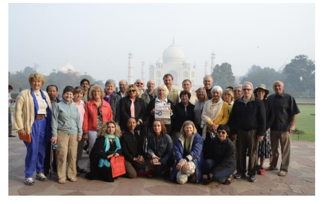
Doctors-on-Tour - India