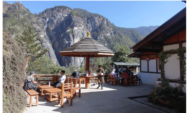
View from the cafeteria

After lunch, all group members will visit a Traditional Farm House . The beauty of Bhutan is embellished by the clusters of quaint farm houses. Bhutanese farm houses are very colorful, decorative and traditionally built with mud and stones and without the use of single nail - all houses follow the same architectural pattern. A visit to a farm house & interaction with it's family as you enjoy tea & coffee is very interesting and offers a good glimpse into the lifestyle of village lifestyle.