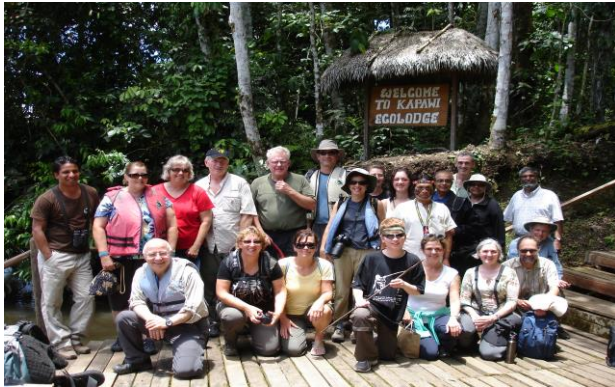
Doctors-on- Tour – Ecuadorian Amazon