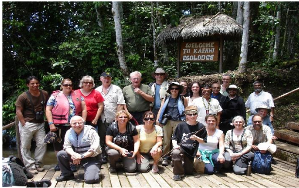
Doctors-on- Tour – Ecuadorian Amazon