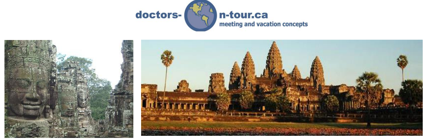
Bayon, Angkor Thom