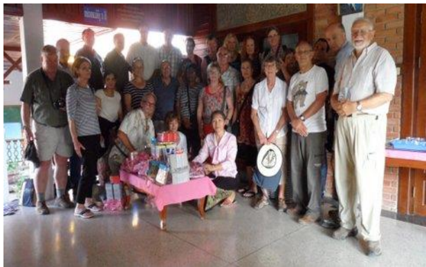
Doctors-on-Tour – South East Asia