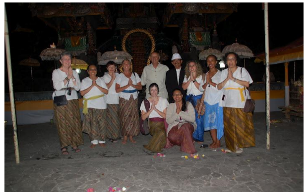
doctors-on-tour – Bali, July 2012