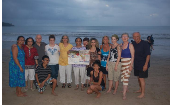
doctors-on-tour – Bali 2012