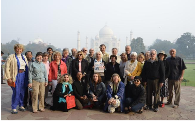
doctors-on-tour - India