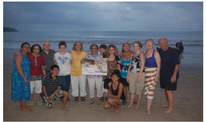
Doctors-on-Tour - Bali