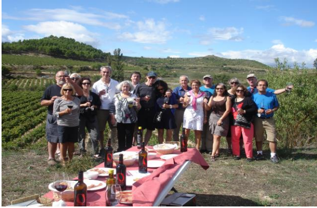
Doctors-on-Tour - Spain