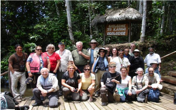
Doctors-on- Tour – Ecuadorian Amazon