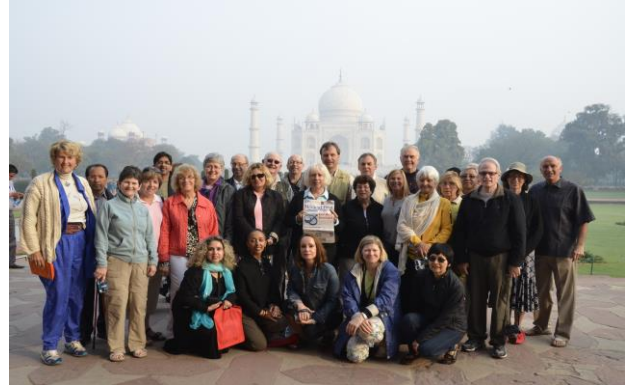
Doctors-on-Tour - India