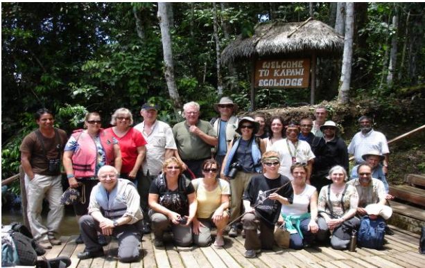
Doctors-on- Tour – Ecuadorian Amazon