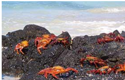
Red lava crabs