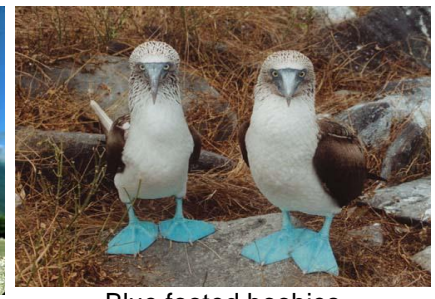
Blue footed boobies