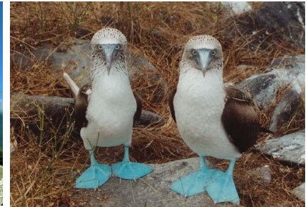
Blue footed boobies