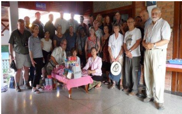
Doctors-on-Tour – South East Asia