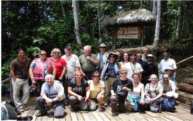
Doctors-on- Tour – Ecuadorian Amazon