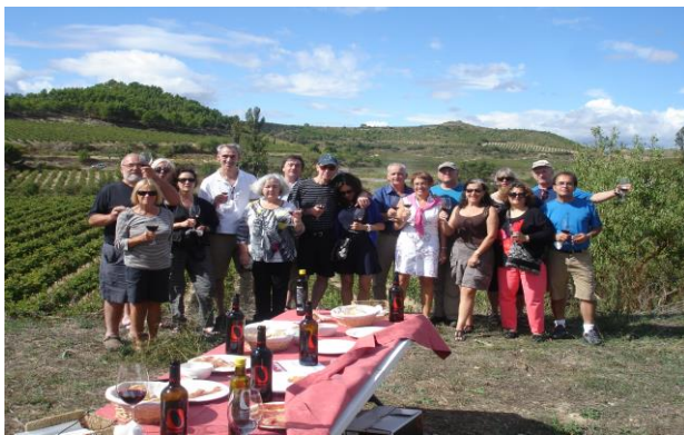
Doctors-on-Tour – Spain