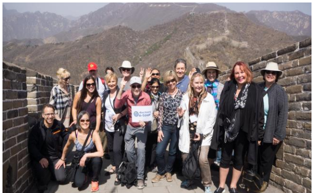
Doctors-on-Tour – China