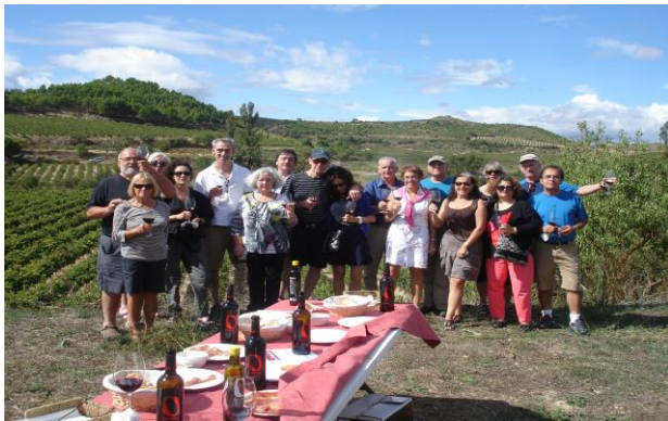
Doctors-on-Tour – Spain