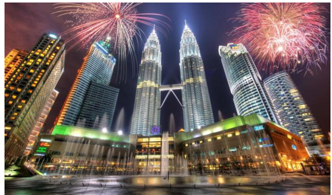
Overnight in Kuala Lumpur.