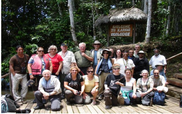
Doctors-on- Tour – Ecuadorian Amazon