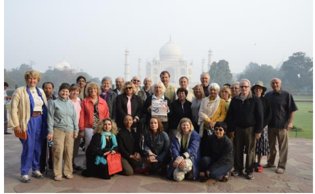
Doctors-on-Tour - India