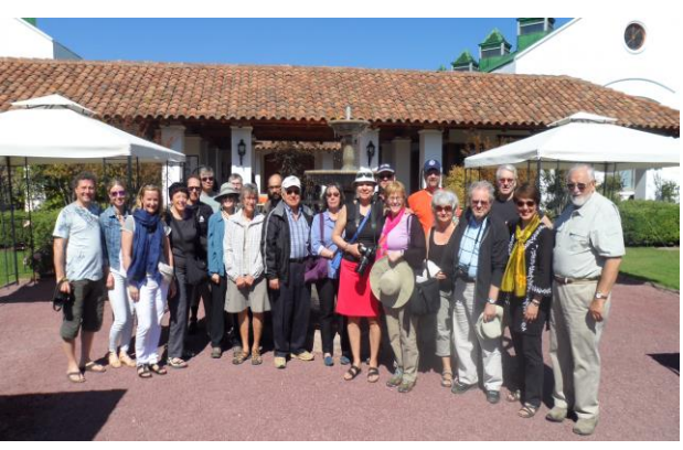
Doctors-on-Tour - Chile & Argentina