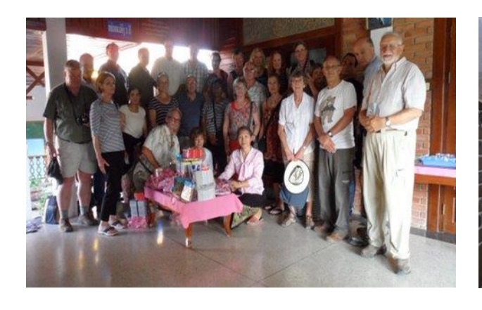
Doctors-on-Tour - South East Asia