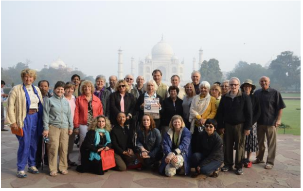
Doctors-on-Tour - India