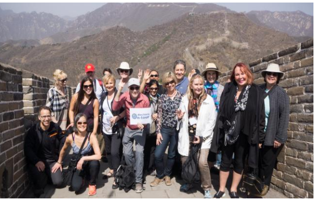
Doctors-on-Tour - China