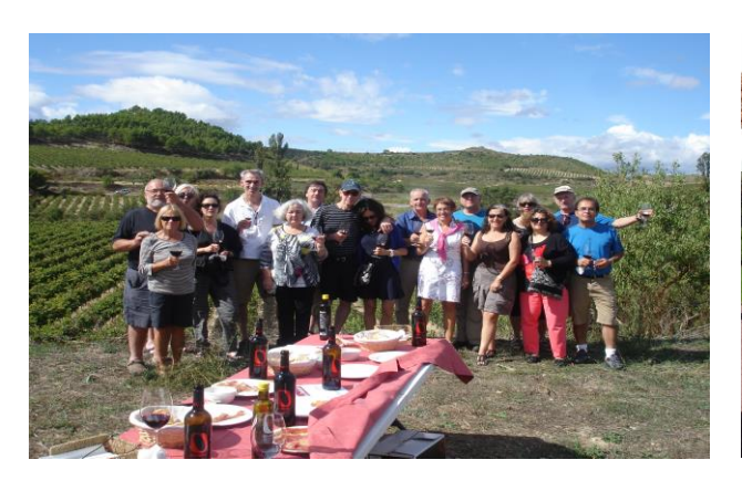
Doctors-on-Tour - Spain