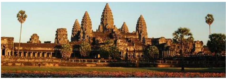
Bayon, Angkor Thom