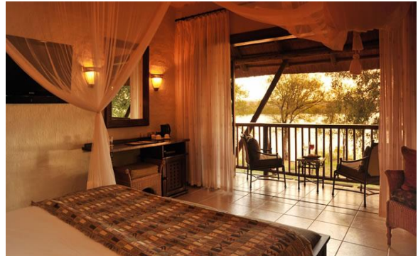
David Livingstone Safari Lodge and Spa