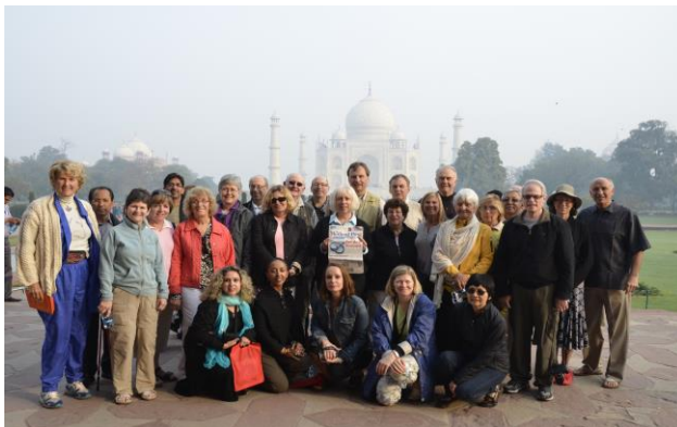
doctors-on-tour - India