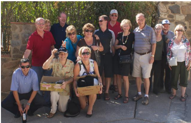
doctors-on-tour - Spain