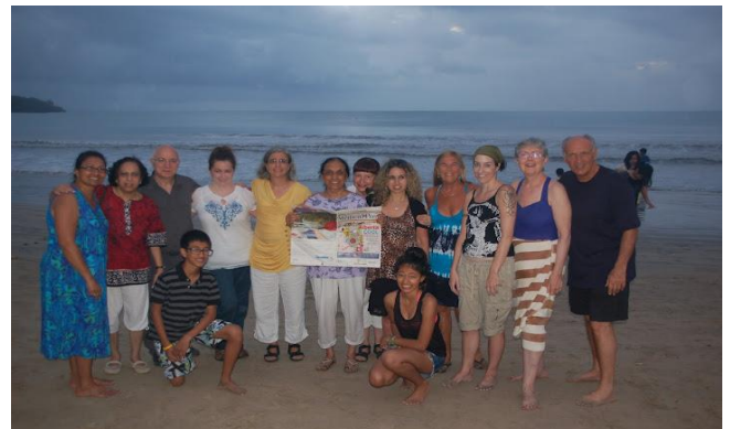
doctors-on-tour - Bali