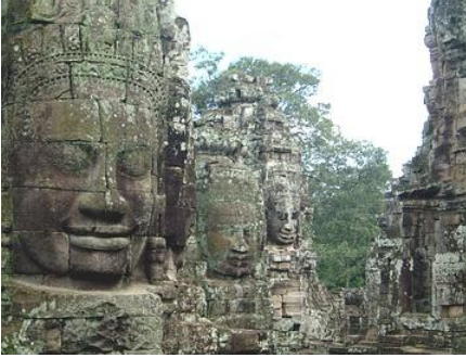
Bayon, Angkor Thom