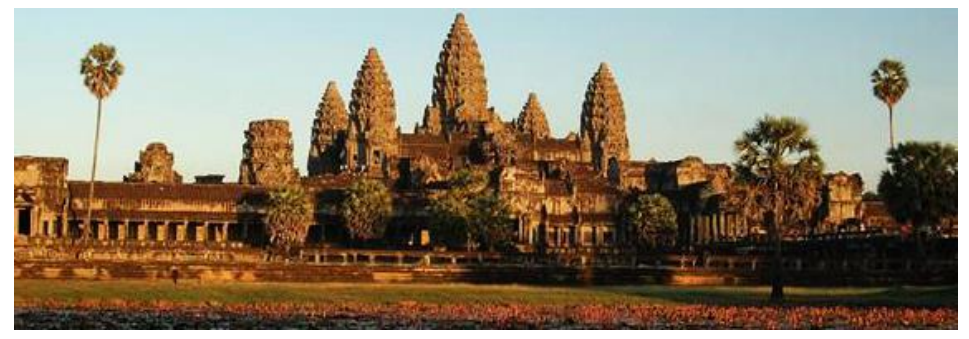
Bayon, Angkor Thom