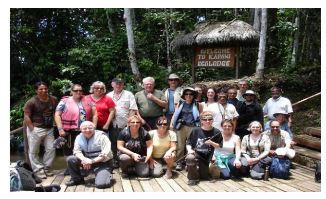
Doctors-on- Tour - Ecuadorian Amazon