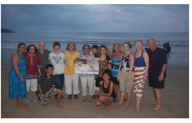
Doctors-on-Tour - Bali