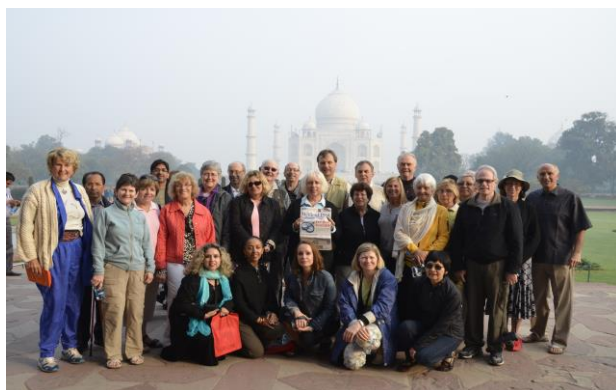
Doctors-on-Tour - India