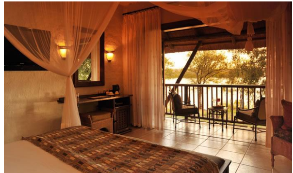
David Livingstone Safari Lodge and Spa