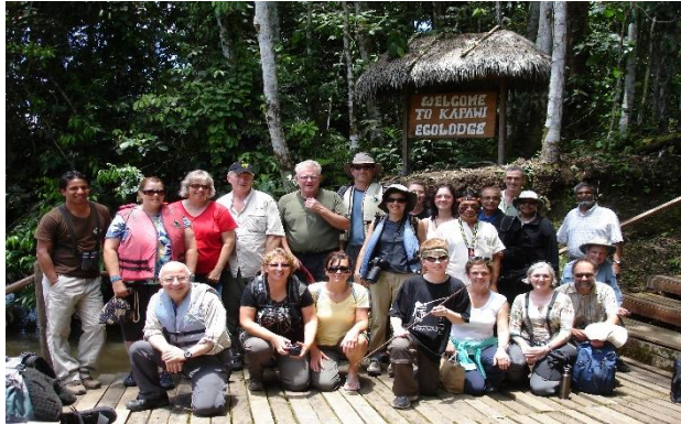
Doctors-on- Tour – Ecuadorian Amazon