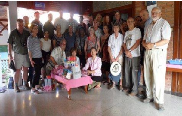
Doctors-on-Tour – South East Asia