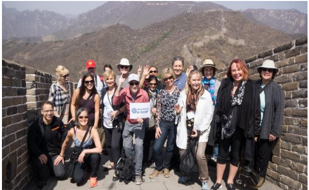
Doctors-on-Tour – China