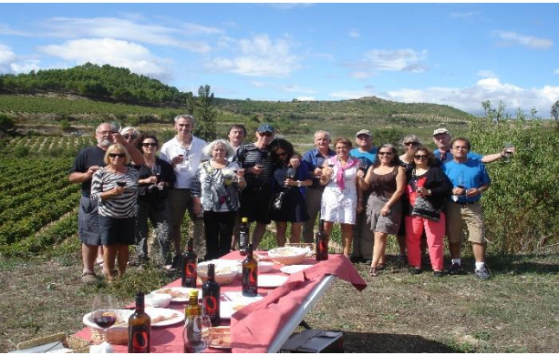
Doctors-on-Tour – Spain