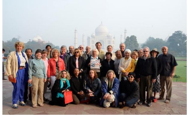
Doctors-on-Tour - India