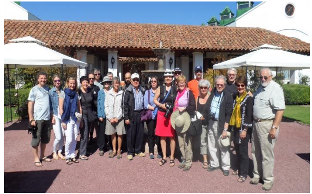
Doctors-on-Tour - Chile & Argentina