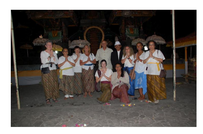
doctors-on-tour – Bali, July 2012