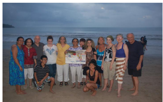
doctors-on-tour - Bali 2012