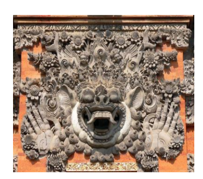
Day 6 - June 20 (Thu) - Ubud - Royal Family & Udayana University (B,L)