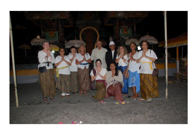
doctors-on-tour - Bali, July 2012