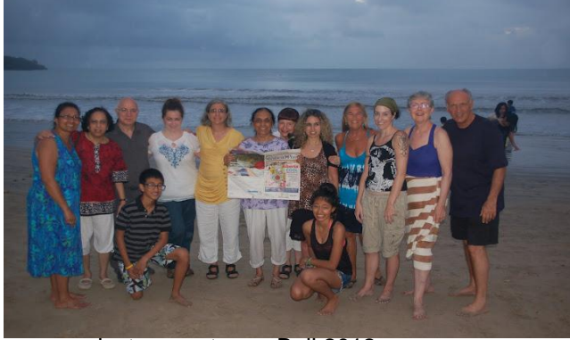
doctors-on-tour - India