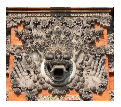
Day 6 - June 20 (Thu) - Ubud - Royal Family & Udayana University (B,L)