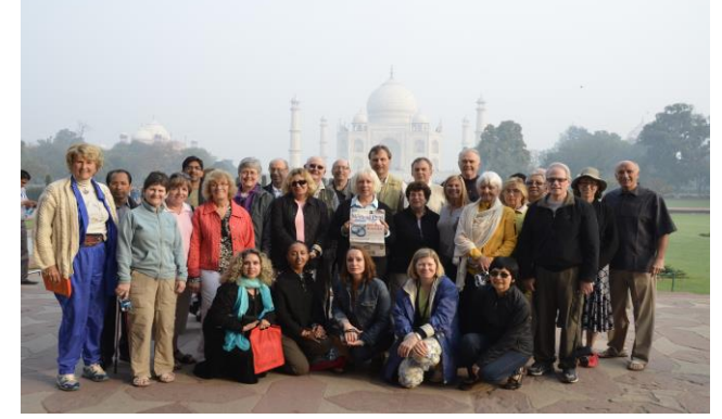
doctors-on-tour - India