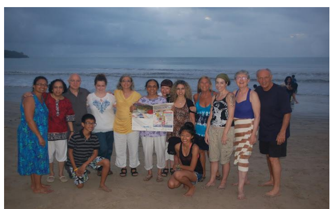
doctors-on-tour - Bali 2012