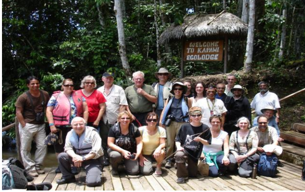
Doctors-on- Tour – Ecuadorian Amazon