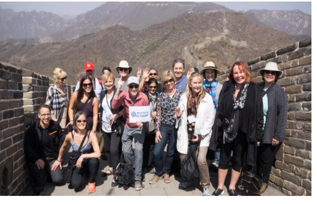
Doctors-on-Tour - China