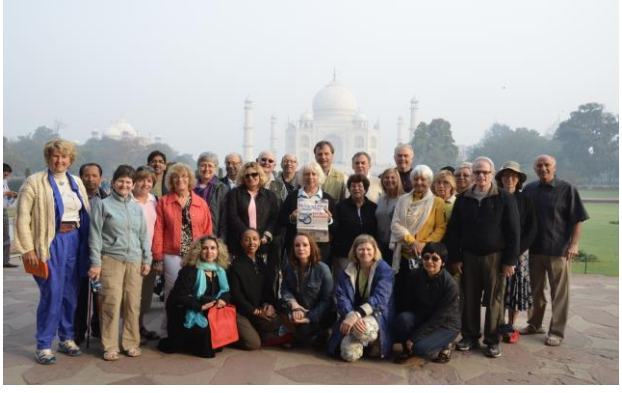
Doctors-on-Tour - India