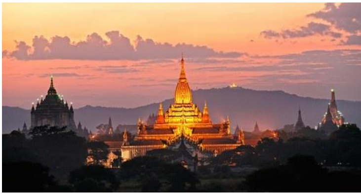
Day 15 - Mar 8 - Bagan - Yangon (B, L)