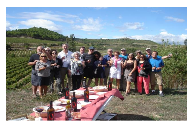
Doctors-on-Tour - Spain