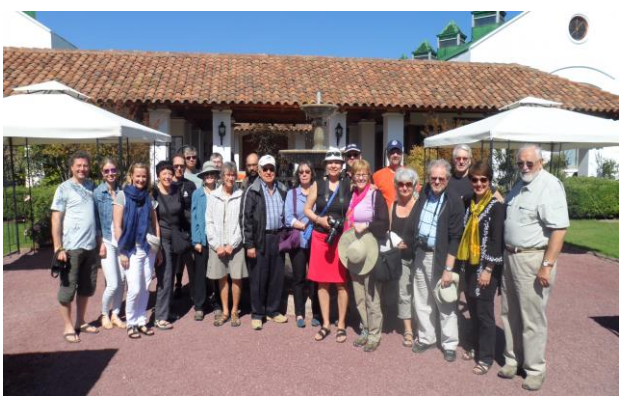
Doctors-on-Tour - Chile & Argentina