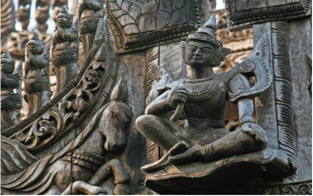
Day 10 - Mar 3 - Mandalay (B, L)