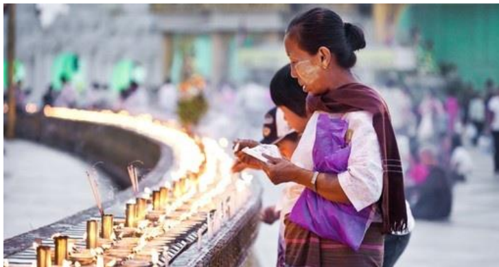
Evening at leisure. Overnight in Yangon.