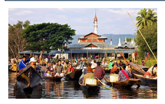
Day 12 - Mar 5 - Inle Lake (B, L, D)

Dinner and overnight at the resort on Inle Lake.