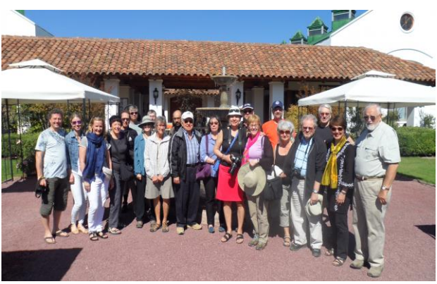
Doctors-on-Tour - Chile & Argentina