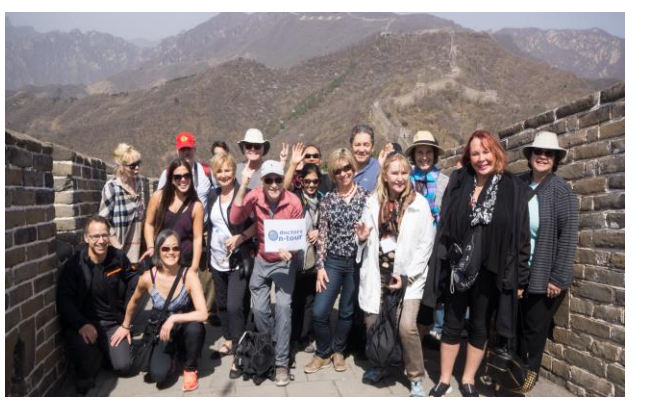
Doctors-on-Tour - China