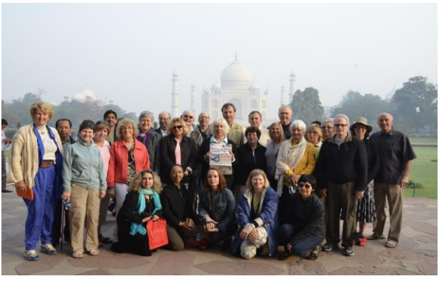
Doctors-on-Tour - India