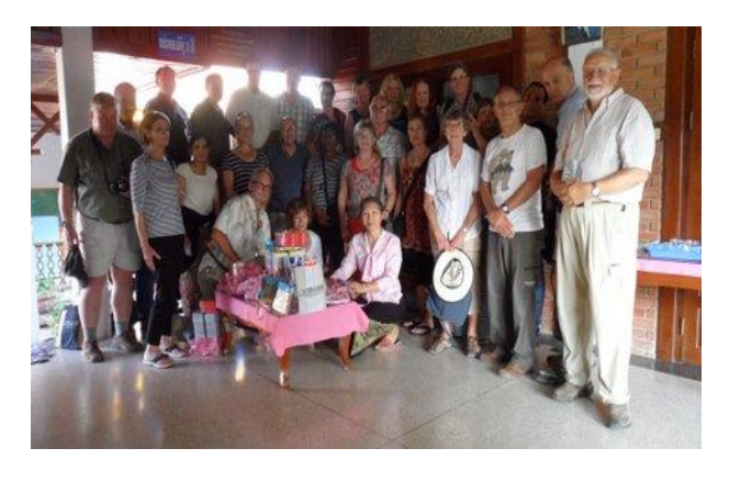
Doctors-on-Tour - South East Asia