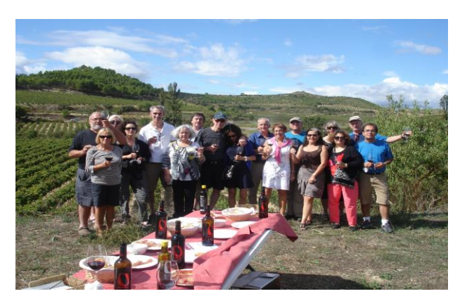
Doctors-on-Tour - Spain