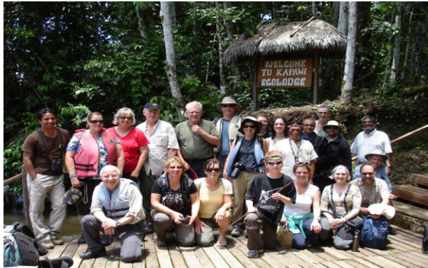
Doctors-on- Tour – Ecuadorian Amazon