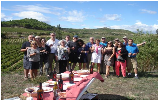
Doctors-on-Tour – Spain