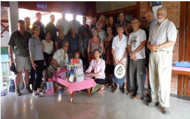
Doctors-on-Tour – South East Asia