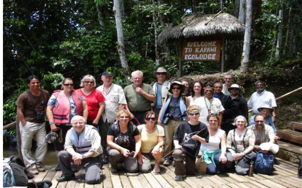
Doctors-on- Tour – Ecuadorian Amazon