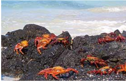
Red lava crabs