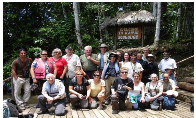
doctors-on-tour - Ecuadorian Amazon