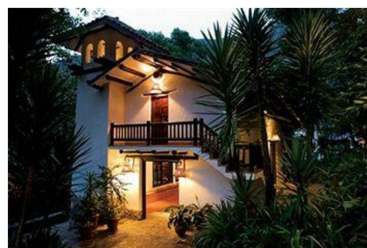
Inkaterra Lodge, Macchu Picchu