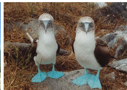
Blue footed boobies

Upon arrival in Quito, head north of the city into the foothills of the Andes to the beautiful area of lakes and distinct picturesque towns of Imbabura province where many of the inhabitants of Quito have their weekend escapes. This is the land of the Otavaleños including South America's most famous indigenous trading fair at Otavalo.