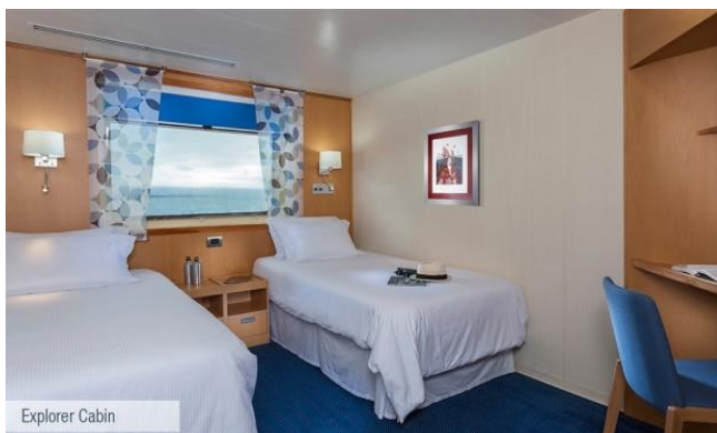
Explorer Double Cabin

* It is not possible to choose specific cabin numbers