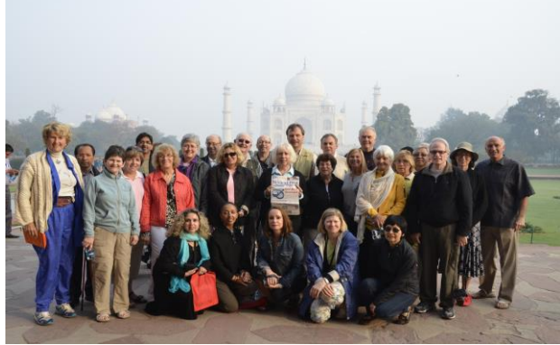
Doctors-on-Tour - India