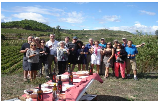
Doctors-on-Tour - Spain