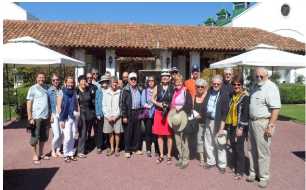
Doctors-on-Tour - Chile & Argentina