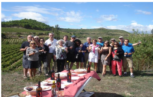
Doctors-on-Tour – Spain