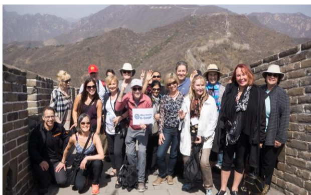
Doctors-on-Tour – China