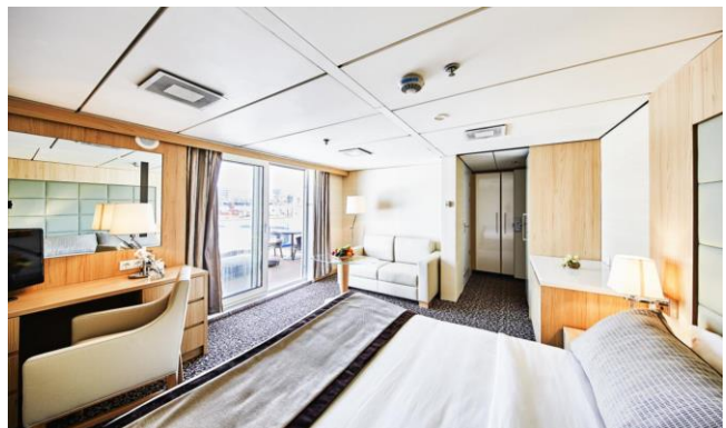
Balcony Suite (Category A)