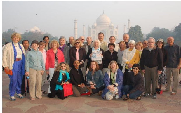
Doctors-on-Tour - India