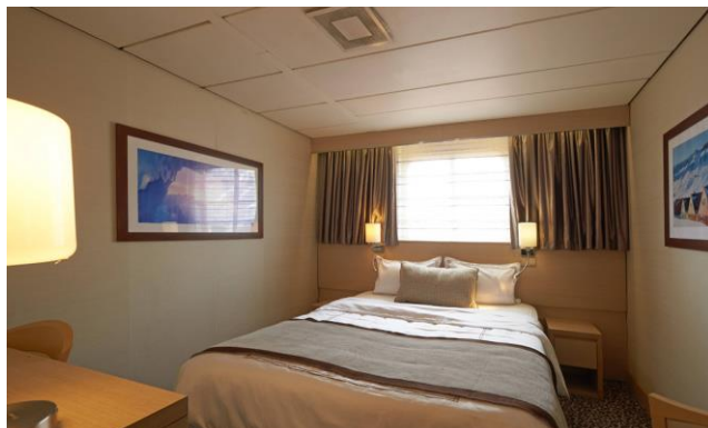
Outside cabin (Category D)

Maximum occupancy per cabin is 2 people (triple cabins may be available upon request).