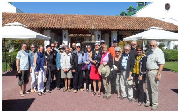
Doctors-on-Tour - Chile & Argentina