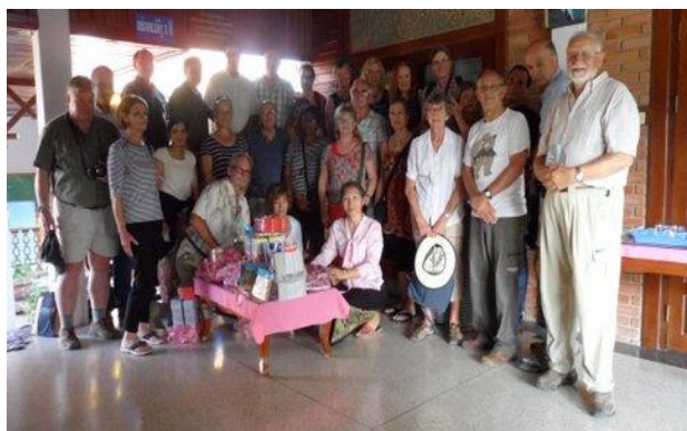
Doctors-on-Tour – South East Asia