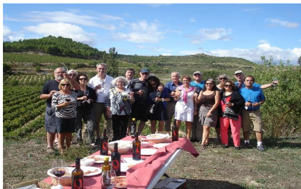
Doctors-on-Tour – Spain