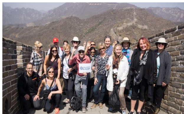
Doctors-on-Tour – China