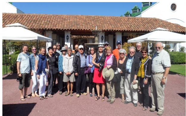
Doctors-on-Tour - Chile & Argentina