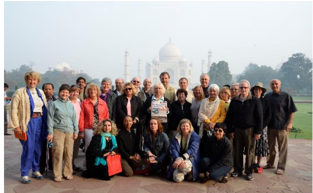
Doctors-on-Tour - India