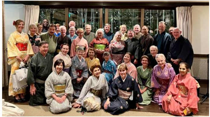
Prior Doctors-on-Tour Japan trips - May 2023 onwards