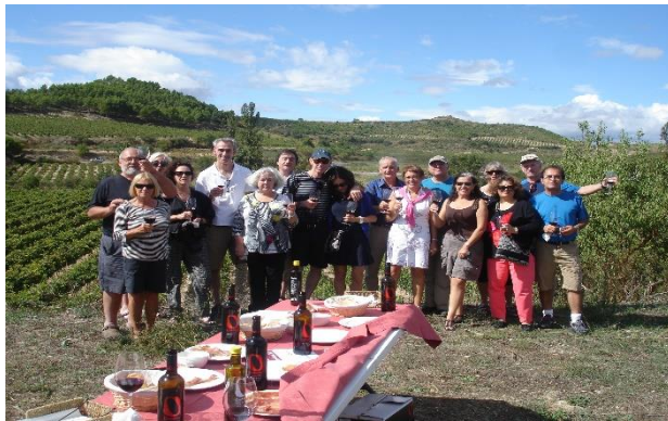
Doctors-on-Tour – Spain