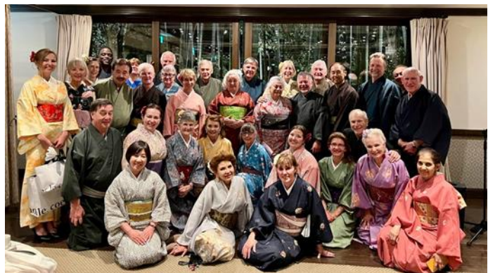
Doctors-on-Tour – Japan May/June 2023