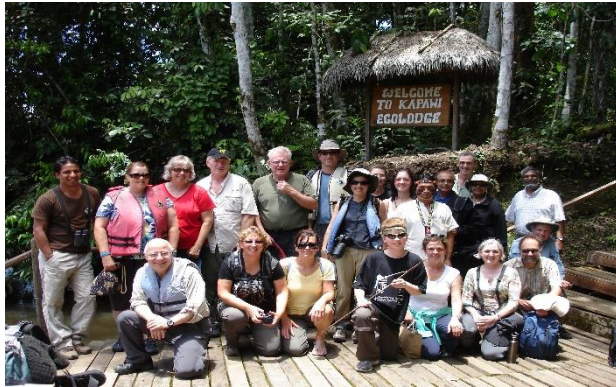
Doctors-on- Tour – Ecuadorian Amazon