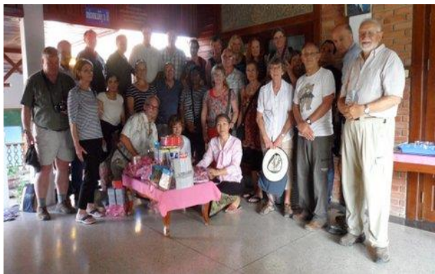
Doctors-on-Tour – South East Asia