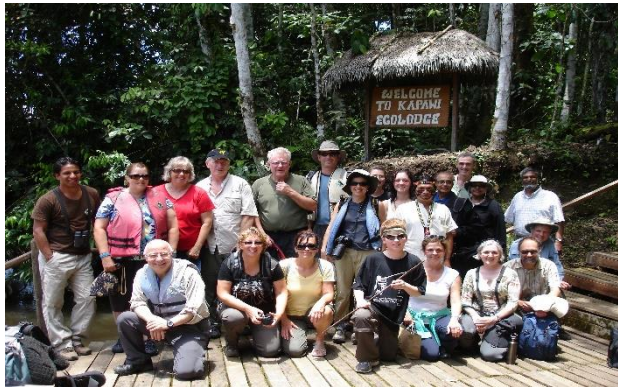
Doctors-on- Tour – Ecuadorian Amazon