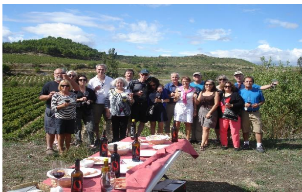
Doctors-on-Tour – Spain