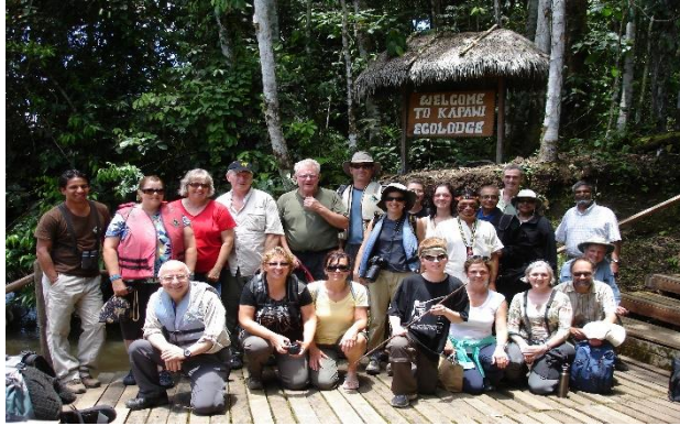
Doctors-on- Tour – Ecuadorian Amazon