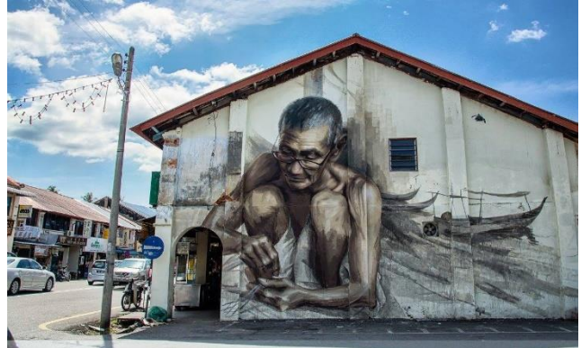
Evening at leisure. Overnight in Georgetown, Penang.