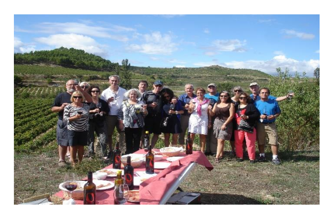
Doctors-on-Tour - Spain