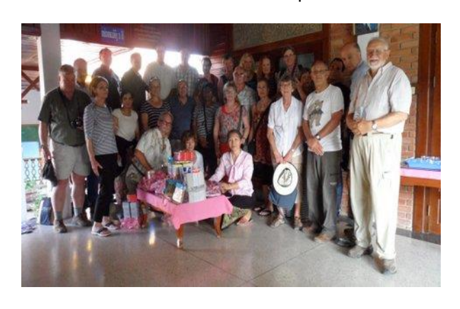
Doctors-on-Tour - South East Asia