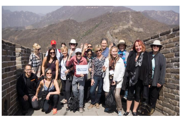
Doctors-on-Tour - China