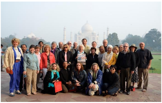
Doctors-on-Tour - India