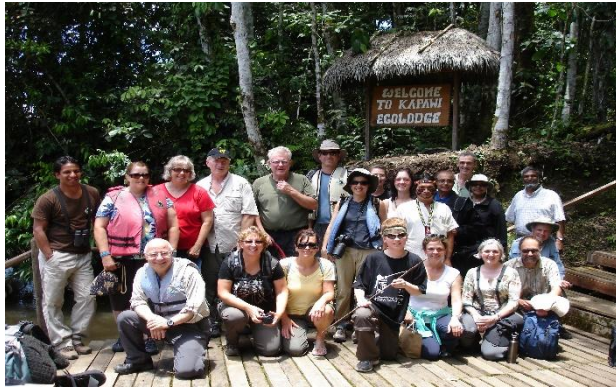
Doctors-on- Tour – Ecuadorian Amazon