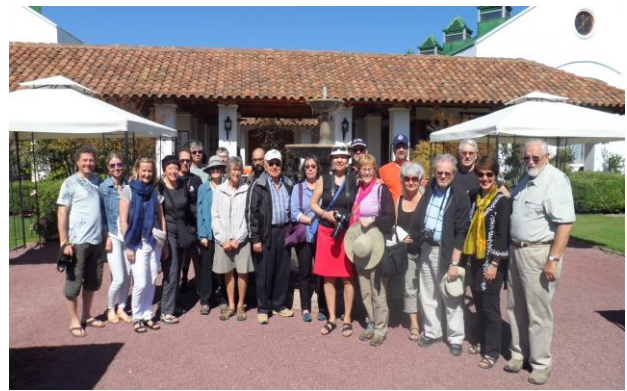
Doctors-on-Tour - Chile & Argentina