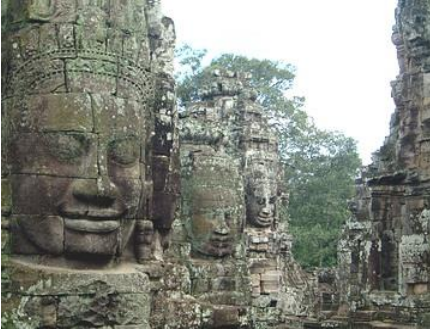
Bayon, Angkor Thom