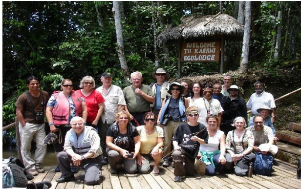
Doctors-on- Tour – Ecuadorian Amazon