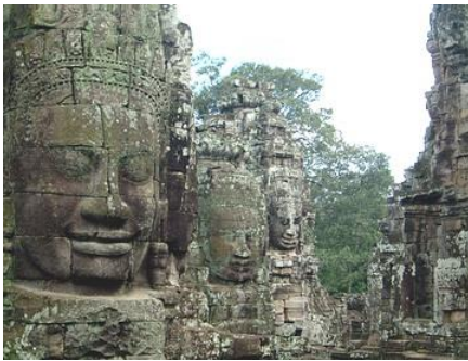
Bayon, Angkor Thom