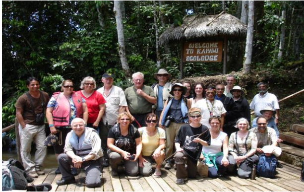
Doctors-on- Tour – Ecuadorian Amazon