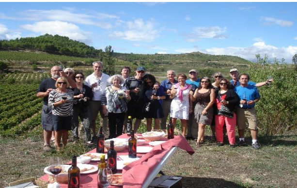
Doctors-on-Tour – Spain