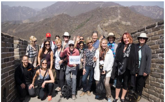
Doctors-on-Tour – China