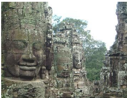
Bayon, Angkor Thom