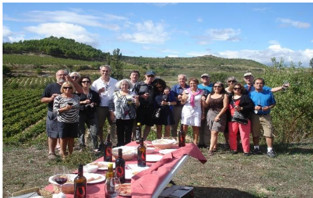
Doctors-on-Tour – Spain