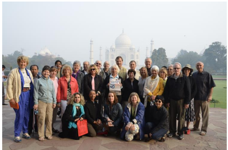
doctors-on-tour at the Taj Mahal

This morning, experience the Taj Mahal . Little needs to be said about this architectural wonder which is the main raison-de-etre for every tourist's visit to Agra. Built by Shah Jahan, the Taj is a white marble memorial to his beautiful wife Mumtaz Mahal. This monument took 22 years to be completed and was designed and planned by Persian architect Ustad Isa. Apart from its stunning design balance and perfect symmetry, the Taj is also noted particularly for its elegant domes, intricately carved screens and some of the best inlay work ever seen.