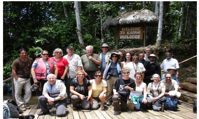
doctors-on-tour - Ecuadorian Amazon