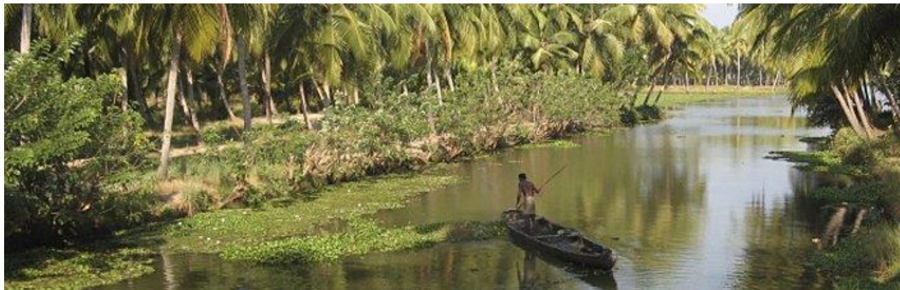
The Kerala Backwaters

EARLY BOOKING PRICING REGISTER BY SEPTEMBER 9, 2013 & SAVE $600 / COUPLE !